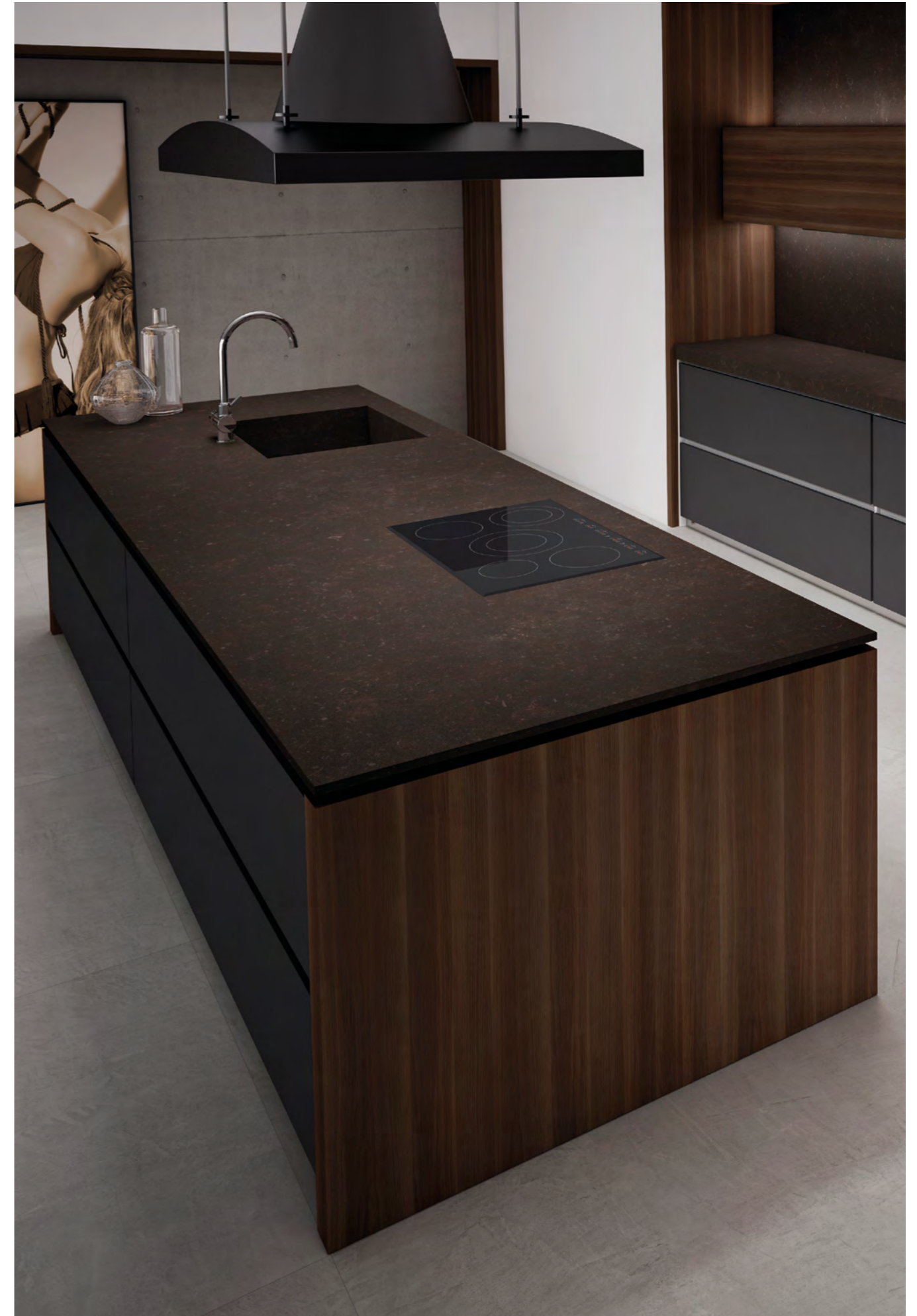
St Vincent Anthracite Natural Linetop 162x324 cm

All sizes are rectified and without bevel edge finish. Todos los formatos son rectificadas y no biselados. Tiles with random shade and aspect variation. Producto con alta variación cromática y destonificación en composiciones.